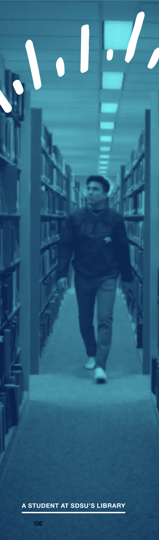
A STUDENT AT SDSU'S LIBRARY

“This was a big turn for SDSU — it was a reinvestment,” he says. “I had listened to the excuses of why we shouldn’t do it. But this is a land grant institution that is established for all people. In this dream,